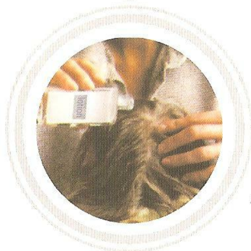
Applying the lotion