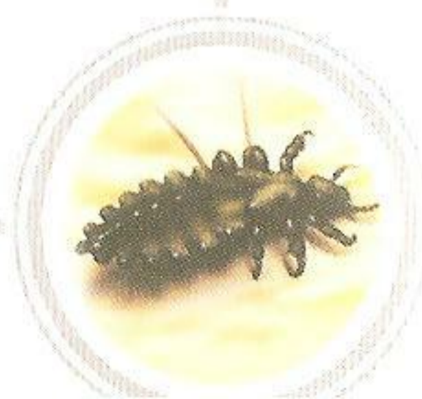
Magnified Head Louse

Hair growth is 1/2 " - 1" per month, therefore a nit positioned 1" from the scalp indicates infestation took place some weeks ago.