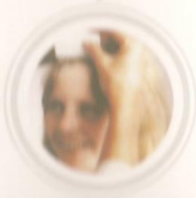
Using the comb