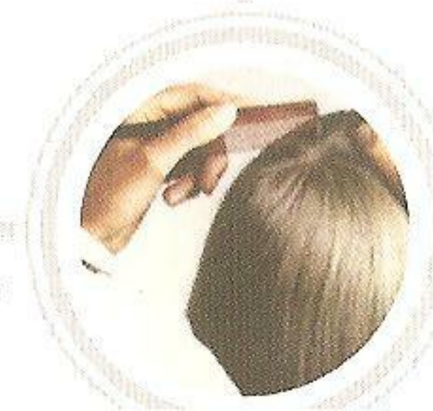
Examining hair for head lice

Brushing will damage the louse and it will die. Use of a bristle brush is more effective. Always dampen hair before fine combing, it is easier to work on hair that is damp.